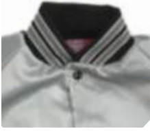
7217 Silver w/ Black-Wht-Silver