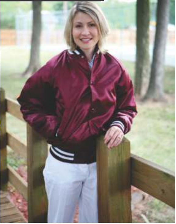
Striped Jacket Colors